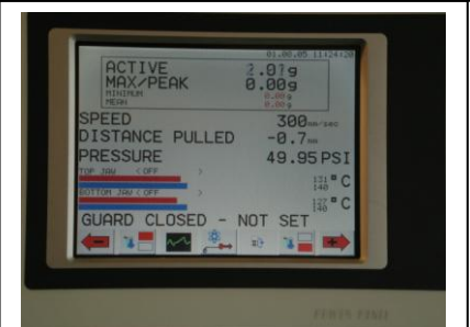
Default screen showing results and settings