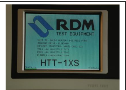
Boot up screen showing model and version

RDM Test Equipment Ltd. Unit 39 Golds Business Park, Jenkins Drive, Elsenham, Herts CM22 6JX UK Tel: +44(0)1279817171 Fax: +44(0)1279815743 e-mail: sales@rdmtest.com web: www.rdmtest.com