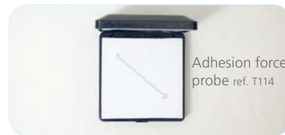
Adhesion force probe ref. T114

Pt-Ir probe with micro roughened surface for measuring adhesion force.