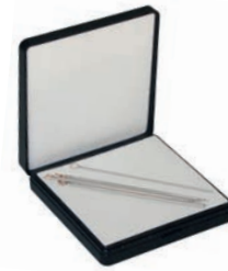
Sample holders for fiber ref. T111