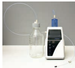
Liquid dispenser, Schott Titronic 300 ref. T101

Software and keyboard controlled magnetic stirrer for sample stirring. Highly recommended for CMC measurements to average the surfactant concentration in the measurement cup after concentration changing.