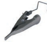
Sample holder for plates ref. T109RF

An active vibration isolation system based on Halcyonics® technology, including two long isolation elements, external controller, bread board table and necessary mechanics. Breadboard size: 900 x 600 x 60 mm 3 . Highly recommended for thin single fiber contact angle studies.